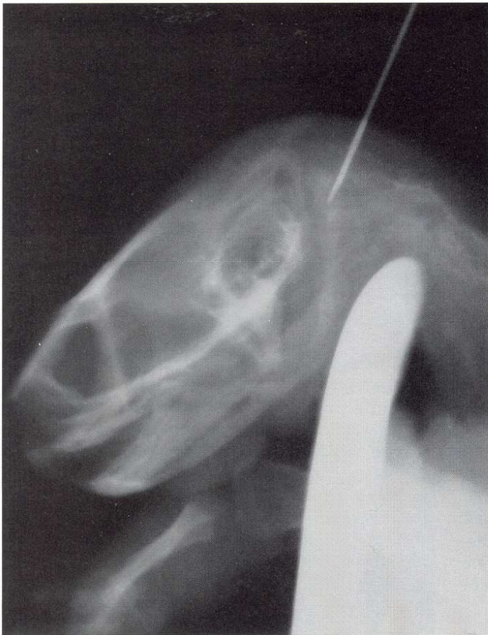
Figure 2. Lateral radiographic view the needle's position in situ when blood can be sampled. Note that foramen magnum is close to the venipuncture site.

hyoid apparatus must be easily palpable with the free (dominant) hand. A 25 ga needle is inserted into the occipital sinus, in the dorsal midline of the neck, just below the hyoid (Figure 2). A 23 ga needle may be necessary in larger turtles.